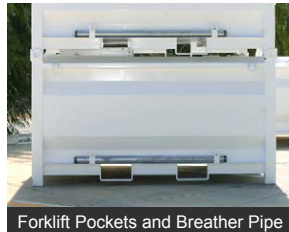
Forklift Pockets and Breather Pipe