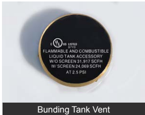
Bunding Tank Vent

All Kubes come complete with dipsticks and free vent pipe and fittings.